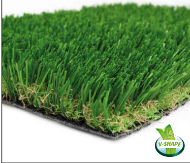
Regal Grass Delite