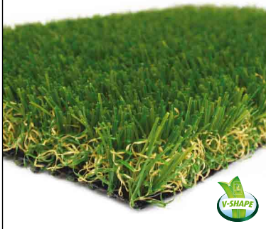
Regal Grass Silk

This variety is similar to Regal Grass Exclusive and has the same dense covering of grass. However, Regal Grass Delite does not have to be finished with ceramic sand. A frizzy brown fibre replaces the sand and gives the grass its natural appearance. The pale brown fiber looks like dehydrated grass, visible just underneath the green fibers, which is also a phenomenon in natural grass. Moreover, Regal Grass Delite is made with the unique v-shaped fiber.