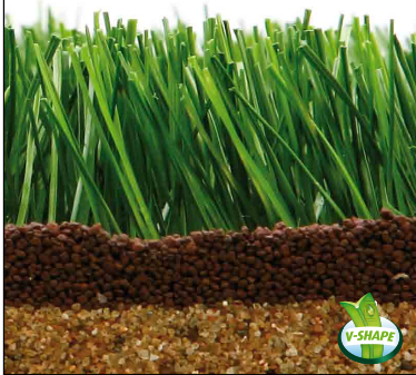
Regal Grass Exclusive

Regal Grass is an innovative brand, which is continuously developing. We have a solution for any grass situation. You will find the most popular ones in this brochure. For the complete and current range, we gladly refer you to our website www.regalgrass.com.au . From there you can contact one of our carefully selected Partners for a personal design consultation and pricing.